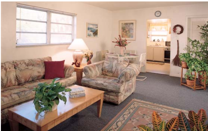
Awakenings for Women

The sixteen apartment buildings of Boca House are divided so that each of the three recovery levels has its own campus. The six complexes are within 1/4 mile of each other and include 1 bedroom/1 bath, 2 bedroom/2 bath, and 3 bedroom/3 bath apartments. Each furnished apartment has a living room with cable TV, dining area and kitchen stocked with the necessary cooking utensils and supplies. Washers and dryers, vending machines and telephones are located at each complex. Additionally, you'll find a beautiful pool, workout area & plenty of parking. And for those that feel that they are ready for life and no longer need the structure we offer graduate housing comprised of seven beautiful houses, each fully furnished with their own washers and dryers and swimming pools.