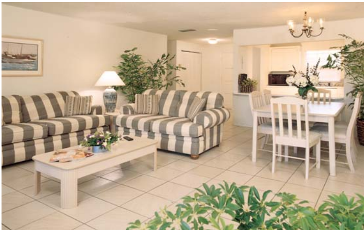
Boca House for Men

Boca House for men and Awakenings for women are two separate recovery communities that share the same goal: we provide a safe environment for you to grow in sobriety. Our program builds, nurtures and supports the reality that there is life after drugs and alcohol; and it is a life of abundance, purpose and meaning.